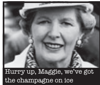
Hurry up, Maggie, we've got the champagne on ice

■ What's all this about Margaret Thatcher getting a £3 million state funeral? Why bother, no one's going to be mourning her death anyway. Just push her body in the fire and scatter the ashes in pub urinals the length and breadth of Britain.