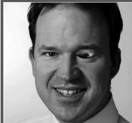
Jesse Norman ... simple

Our guess is that, like every other election, the government will win!