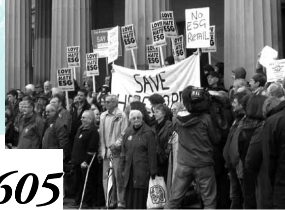
Hereford Solidarity League demonstrate at the Shire Hall against the ESG

Secondly, the campaign needs to step up its action and forget about the importance of looking 'respectable'. Respectability never won the vote for women, it never won a strike or defeated the poll tax. Herefordshire Council have ignored a petition of almost 10,000 people; this campaign will fail unless the council see the active involvement of the thousands that have signed this petition. Let's get out on the streets and make our really voices heard! No ESG!