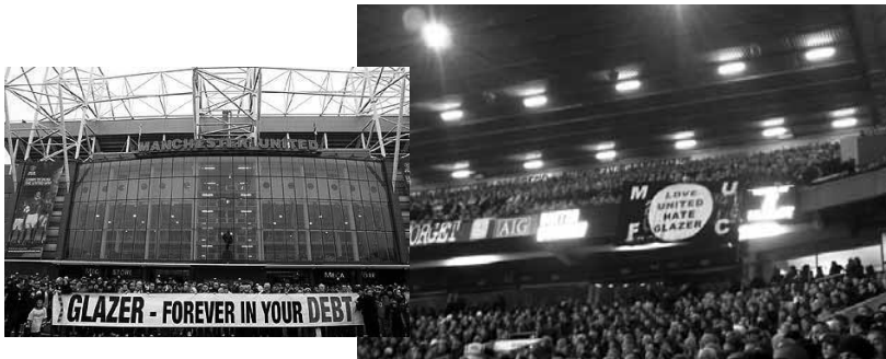
United fans show their hate for Glazer

Maybe he's really a gay, black, Muslim, asylum seeking terrorist that's spreading swine flu under the guise of being England captain! Maybe I should be writing for the Daily (hate) Mail.