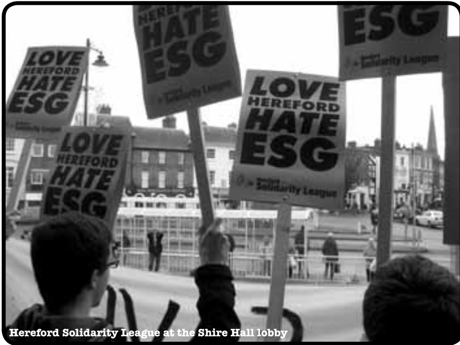
Hereford Solidarity League at the Shire Hall lobby

The bulletin of Hereford Solidarity League Freedom • Equality • Community #11 • December/January 2009/10 Free/Donation