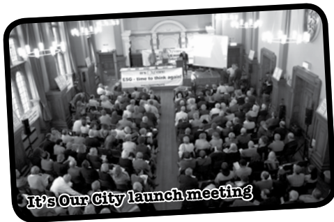
It's Our City launch meeting

Firstly, we need campaign decision-making open to everyone. The It's Our City public meetings could be open discussions for where to go next. We will only win with mass, grassroots support from the people of Herefordshire so we must all have the same opportunities to get involved and have our say.